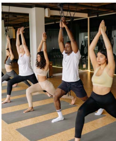
Health & Well-Being