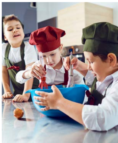
Children & Youth