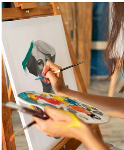
Arts & Culture