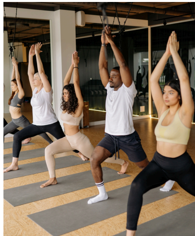
Health & Well-Being