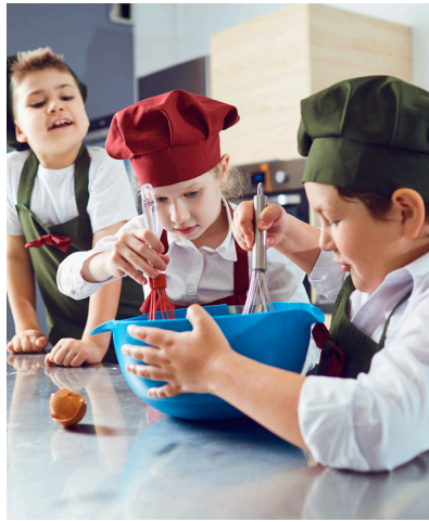
Children & Youth