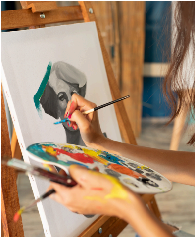
Arts & Culture